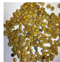
After Separator Good