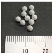
After Separator Good