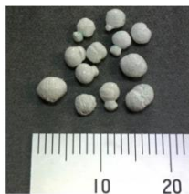
After Separator Foreign