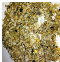
After Separator Foreign